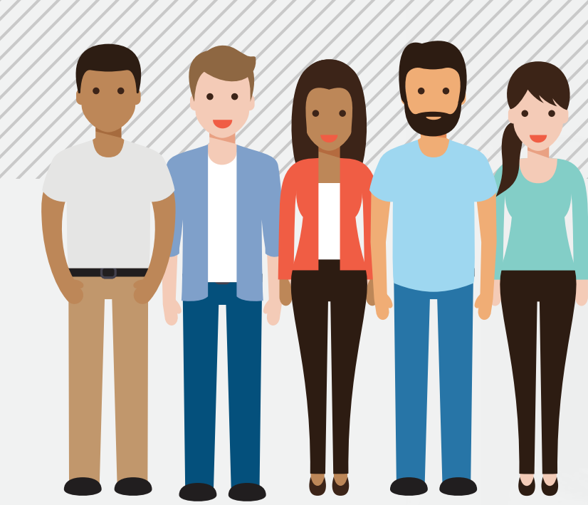
IMPROVED LEARNING ENVIRONMENTS

Human rights education is an effective tool to create learning environments free of discrimination and with higher levels of engagement